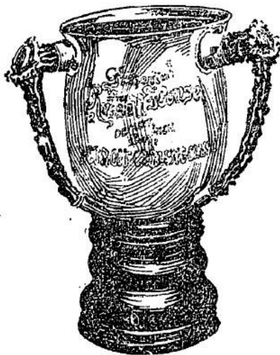
RUSSELL HOUSE TROPHY.

“THE ICE IS PROMISED. Curlers prepared for the Bonspiel this week. Twenty clubs have entered the contests. Splendid Trophies for the Winners. Just now there is great activity among the members of The Detroit Curling Club, and especially those who are on the ice committee. The International Bonspiel is to begin here on Wednesday and it is the duty of the committee to provide ice. Committeemen were racing up to the weather office yesterday and members of the club were burning up the phone wires in quest of anything but rain. When word came that there is a wave pointed at us and which will avenge the premature advent of spring there was happiness. Everything else has been provided and if the cold snap strikes here and throws out the anchor there will be plenty of fun for the curlers this week.