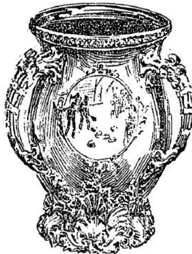
THE WALKER CUP.